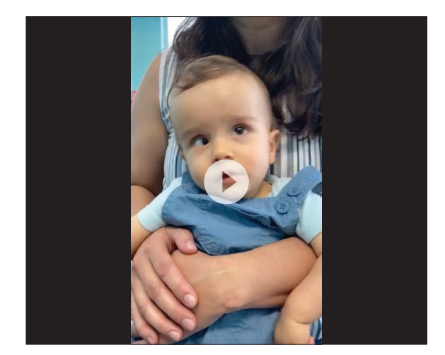
Video. Rotational pendular nystagmus of both eyes (fine amplitude, moderate frequency, symmetrical and conjugated) on physicial examination.

ments and oscillopsia. He also has low vision, without any eye globe abnormalities or refractive error, which can be explained by the level of nystagmus and neurologic pathology. Regarding cognitive skills, he understands instructions, recognizes colors, and uses some words. He is being periodically evaluated by a multidisciplinary team that evolves Neuropediatrics, Ophthalmology, Endocrinology (due to subclinical hypothyroidism), Gastroenterology (due to gastroesophageal reflux), and Pediatric Surgery (due to cryptorchidic testes). Brain auditory-evoked potentials were normal. He is also under speech, occupational and physical therapy.